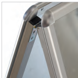
Rounded corners for safety.