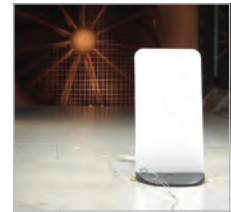
Ecoflex pavement signs tested to Storm Force 10 Beaufort Scale.

Incredibly secure – wedge simply slots through panel and locks into place.