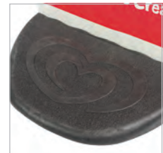
Bases available with embossed logos (min. order quantity 500).