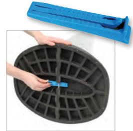
Unique patented design

Incredibly secure – wedge simply slots through panel and locks into place.