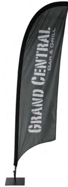
Showing black reinforced elasticated pole sleeve and Base Plate