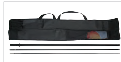
Black canvas bag supplied with each pole includes compartments to store flag, ground spike and water bag.