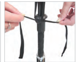
Adjustable draw string tethers for optimal tensioning.