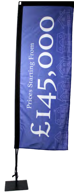
Showing black reinforced elasticated pole sleeve and Base Plate