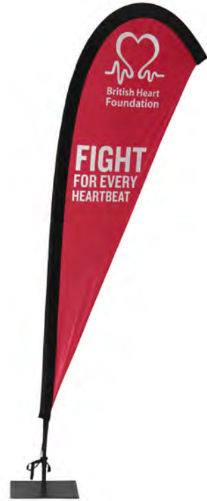
Showing black reinforced elasticated pole sleeve and Base Plate